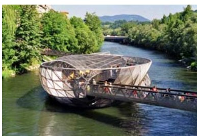
Cafe at the Murinsel