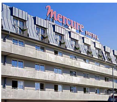
Hotel Mercure Graz Messe