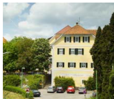
Hotel Pfeifer Kirchenwirt