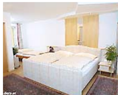
Gasthof Zum Sternwirt