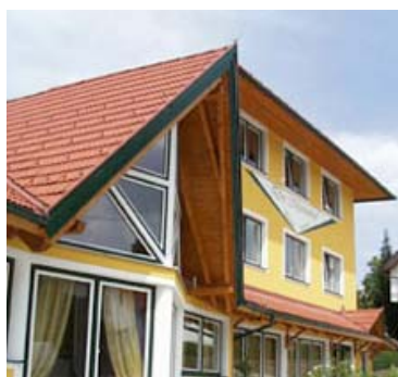
Der Marienhof Hotel