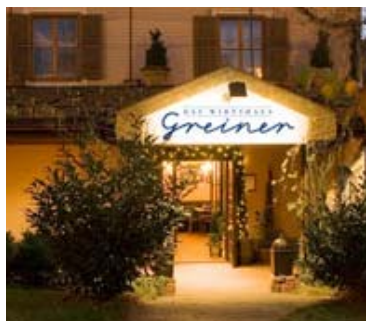
Hotel Wirtshaus Greiner