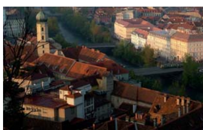
Grand Hotel Wiesler